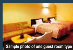
Sample photo of one guest room type